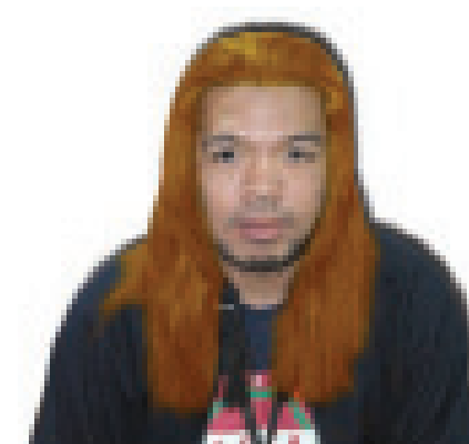
Berambut Warna Fesyen Ganjil Brightly Coloured and Odd Hairstyles