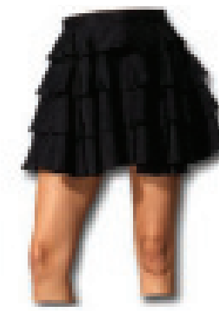
Skirt Pendek menampakkan Lutut Skirt that shows the Knee