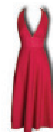
Mendedahkan Bahagian Badan Body-Revealing Clothes