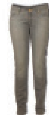
Berseluar Ketat Tight Pants