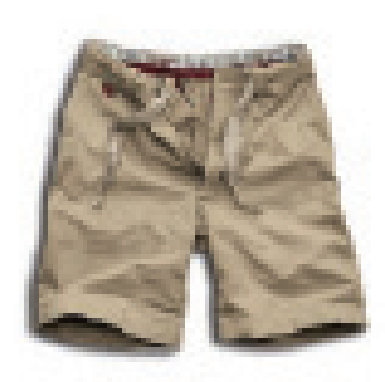
Berseluar Pendek Shorts