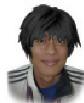
Rambut Yang Tidak Kemas Unruly Hair