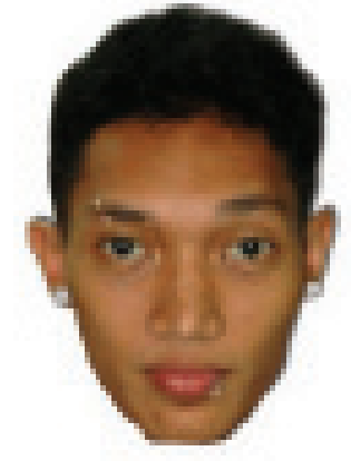
Aksesori Muka Face Accessories