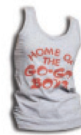
Tanpa Lengan Sleeveless