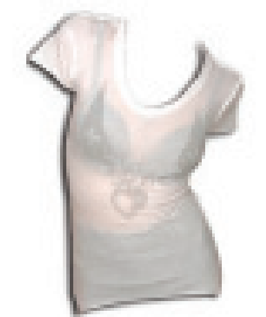
Baju Jarang dan Ketat Tight and See-Through Clothes