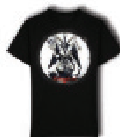
Baju T Bergambar Yang Bertentangan Tatasusila T-Shirt with Derogatory Picture/ Words